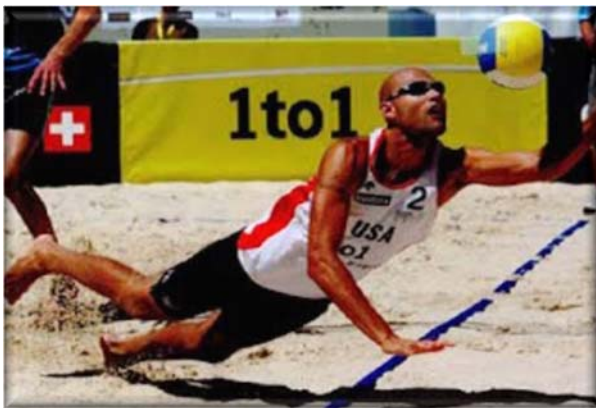
Phil Dalhausser - Beijing Olympics 2008

Beijing Olympian Phil Dalhausser played this tournament from 2006-2009!